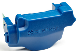
Hand Hygiene Sensor - Embedded