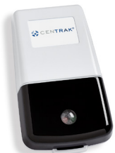
Hand Hygiene Sensor