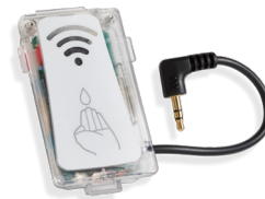
Hand Hygiene Sensor - Embedded